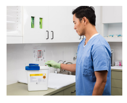
Pharmaceutical Waste Solutions Disposal of unused and particiallyused pharmaceutical waste, including dental carpules.