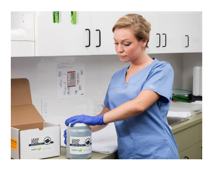
Lead Waste Recovery Providing an easy and cost-effective way to recycle your lead waste via a mailback service.